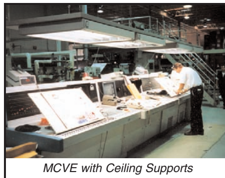
MCVE with Ceiling Supports

The MCVE system is a ceiling-mounted viewing environment, custom-tailored and designed to provide accurate viewing conditions on the viewing surface while blocking ambient light sources. Rear walls and sidewalls are optional and completely modular. The MCVE comes complete with the LiteGuard II system monitor.