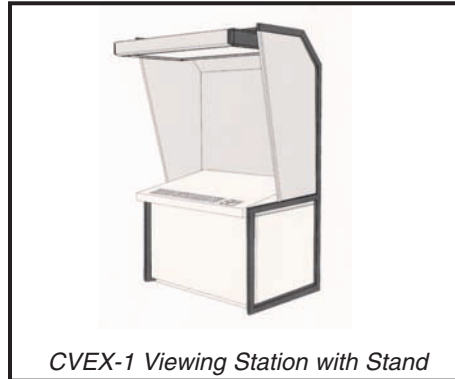
CVEX-1 Viewing Station with Stand

The CVEX system is custom-tailored to fit a press control console or a work/viewing table. It is available with or without sidewalls and comes complete with the LiteGuard II® system monitor. The size ranges are approximately those indicated in the chart to the right.