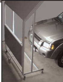
Castors included for positioning