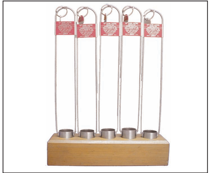
EZ Viscosity Cup Set with Stand

All EZ Viscosity Cups are calibrated. If a certificate of calibration is required, it may be ordered at an additional charge. This certificate contains information on actual cup calibration with standard oils traceable to the National Institute of Standards and Technology. The certification also complies with ANSI/NCSL Z540-1 and MIL-STD-45662A requirements.