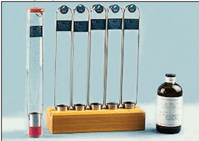
EZ Viscosity Cup Set with Stand and Calibration Oil

These oils are produced in accordance with the following standards to be used with EZ Cups: ISO 9002:1994; EN ISO 29002:1994; BS EN ISO 9002:1994; ANSI/ASQC Q9002:1994.